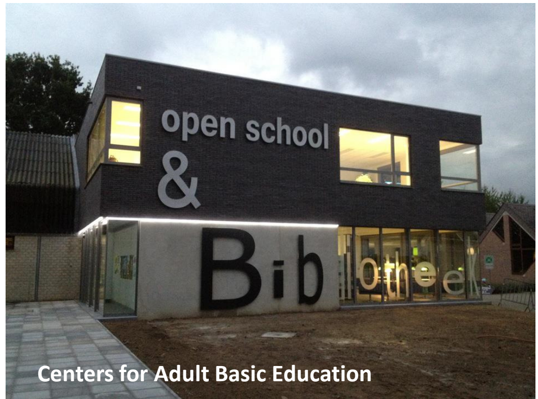
Centers for Adult Basic Education